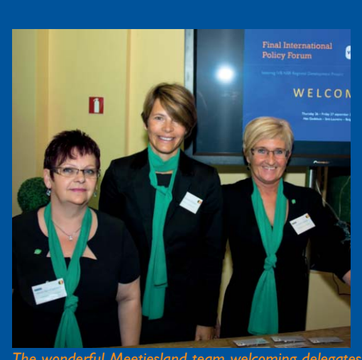
The wonderful Meetjesland team welcoming delegates

Newsletters 5 to 7 were finalised and published in time for the Forum and can be downloaded from our website, www.vitalruralarea.eu.