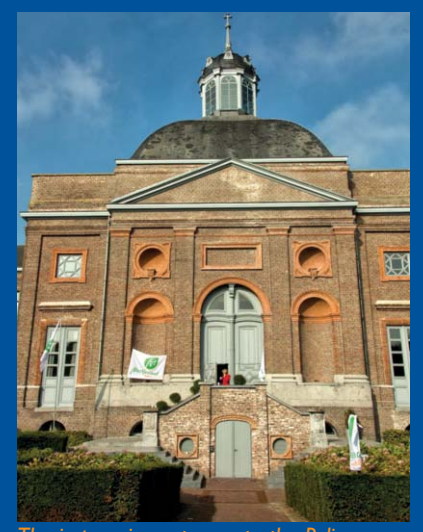
The impressive entrance to the Policy Forum venue, the Godshuis

Following on from the preparations for the fourth and final Policy Forum, which began in late 2012, the Forum itself on 26 and 27 September 2013 in Sint-Laureins, Meetjesland/BE was a success with 230 delegates attending. The overall project results and the initial findings of the Rural Power Pack (RPP) were presented and discussed with a number of experts and keynote speakers.