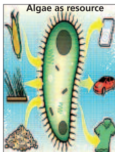
Algae as resource