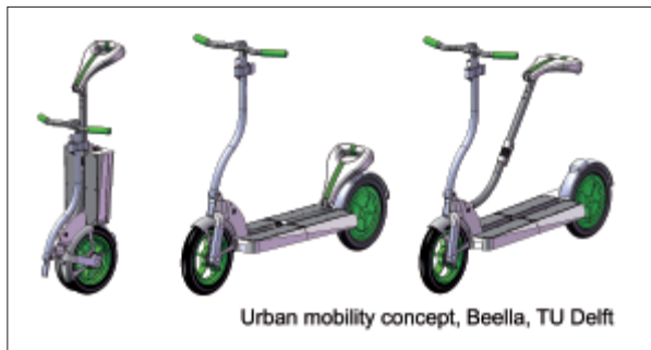
Urban mobility concept, Beella, TU Delft