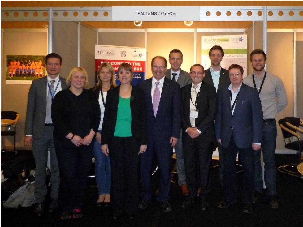
TEN-TaNS partnership, Aberdeen City and Shire 2014

Further information on the TEN-TaNS project can be found at: www.tentans.eu .