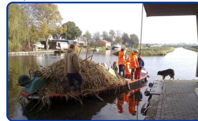
In Langedijk (above), we've seen the work of the Veldzorg Foundation which manages and maintains the historic

They're using their experience within WfG to prepare a study on the potential for such social and community engagement and are trying to identify the role for a the social economy in delivering the Shipley Canal Regeneration Zone along the corridor of the Leeds & Liverpool Canal in Bradford.