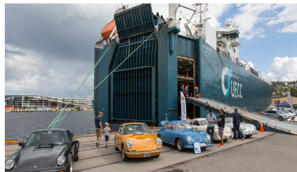
Port of Drammen - visiting a car vessel