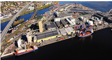
Port of Drammen

For more information visit www.lopinod.eu