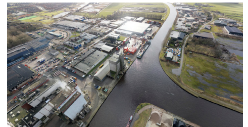
Port of Meppel