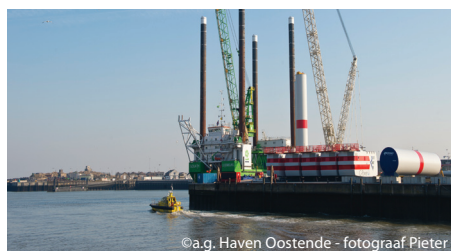
Port of Ostend

For more information visit www.lopinod.eu/news/opendays2014