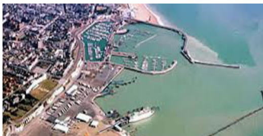
Port of Ramsgate

For more information visit www.lopinod.eu/news/discussing-the-eu-sulphur-directive