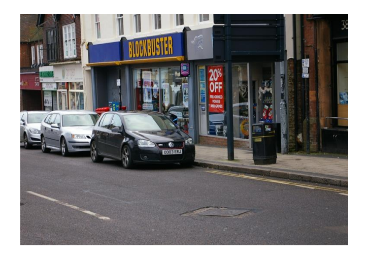
Figure 11: This may be exacerbated where on-street spaces are in high demand for short-term use

EVs (for 2 hours +) deterred short term parking by their customers, with consequent loss of trade. Figure 11 suggests the possibility of similar conflicts outside a video hire shop.