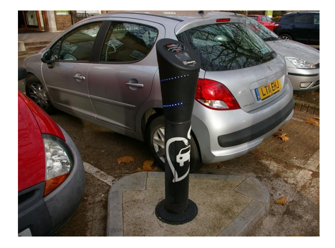
Figure 10: Lack of signage to reserve spaces for EVs may undermine their utility

The situation may be exacerbated where adjacent premises and land-uses are not compatible, e.g. a chargepoint outside a fast food outlet raised objections from the proprietor that the recharging of