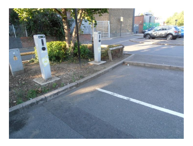
Figure 7: Conversely, points that are conspicuously under-used do little to promote electric mobility

If, however, such parking spaces are conspicuously underused, the effect may be the opposite to that which was intended, as illustrated in Figure 7.