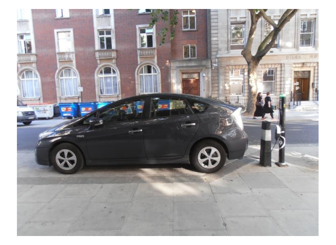
Figure 6: Well-sited, well-used points can attract favourable attention from passers-by

If, however, such parking spaces are conspicuously underused, the effect may be the opposite to that which was intended, as illustrated in Figure 7.