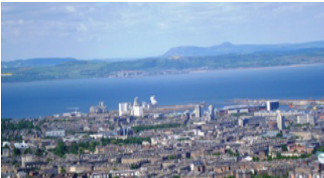
View of Edinburgh

To develop in Scotland a Research Institute renowned throughout Europe and the World for the Quality and Diversity of its work in transport