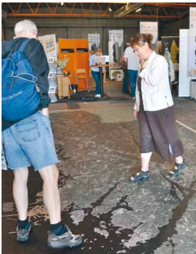
< The photo is from the fair – a living Bohuslän 2010, in Kungshamn in the municipality of Sotenäs

questions and make long term political decisions based upon the principles of IZCM. The municipalities are small, though working together helps lifting the common questions to both regional and national level.