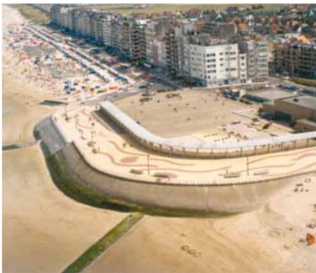
< The coastal town of De Haan-Wenduine

needed in both areas. For these an optimisation for the design of safety measures with regard to tourism will be discussed and elaborated using numerical and physical models as a communication tool.