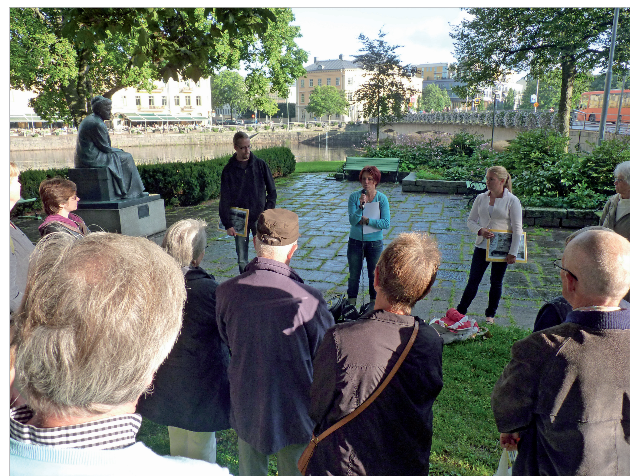
Flood walk where the public in Karlstad was invited, Aug 2011.