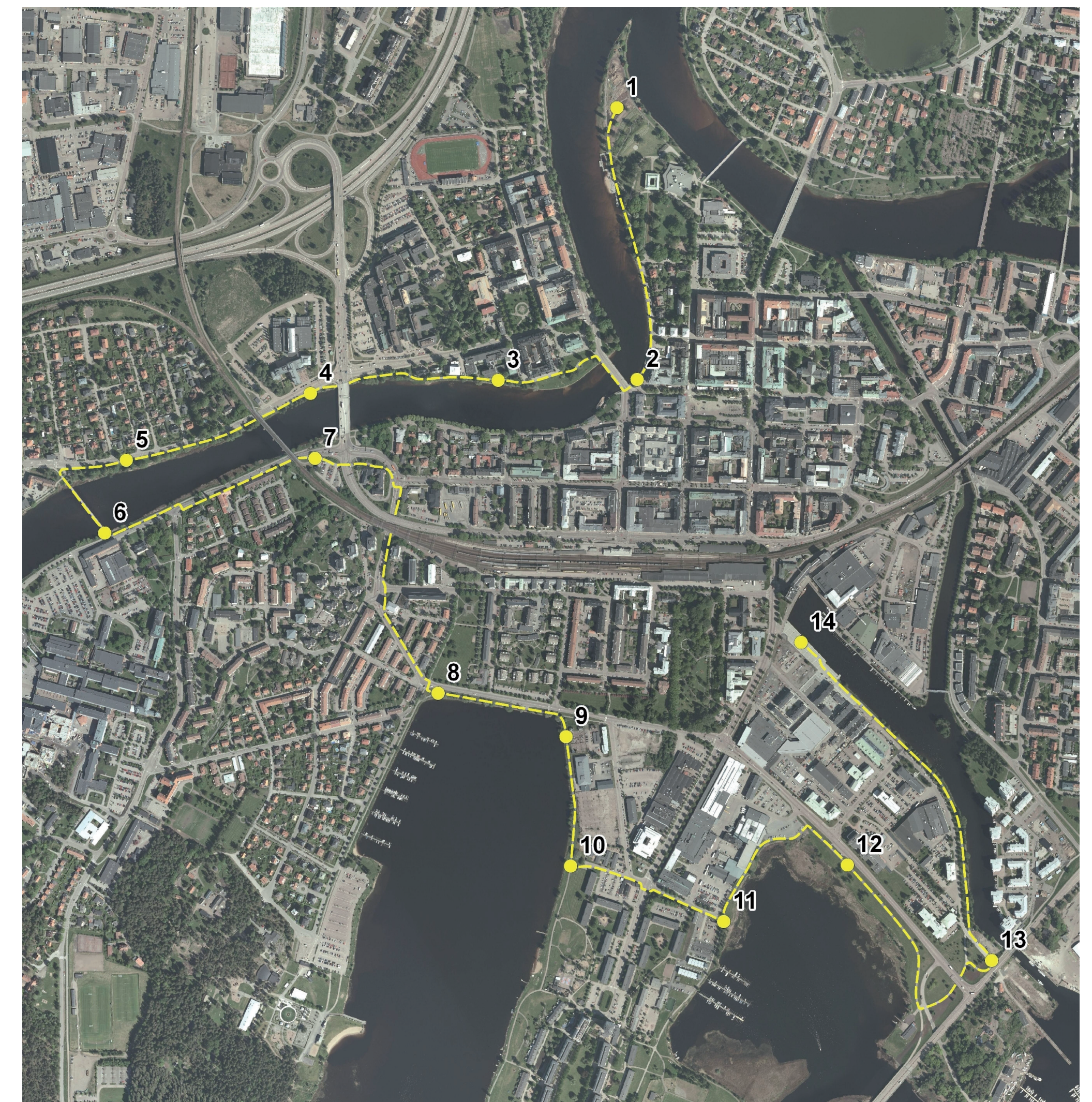
Map of Flood walk in Karlstad with all 14 stops. Normally 5-6 stops are used during one walk.