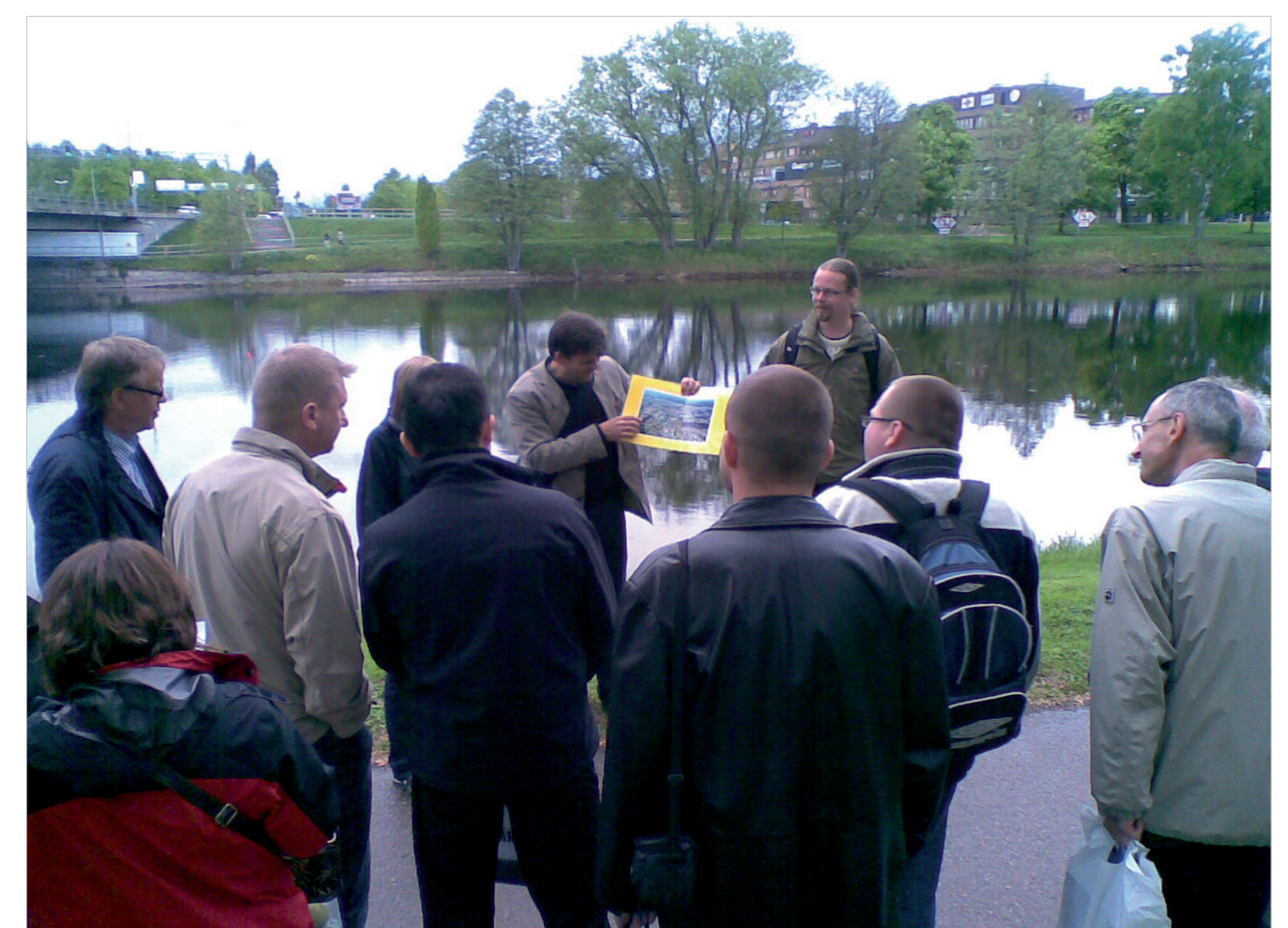
Flood walk with a delegation from Schlesien, Poland in May 2011