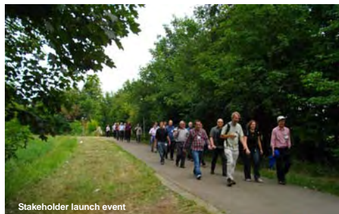
Stakeholder launch event