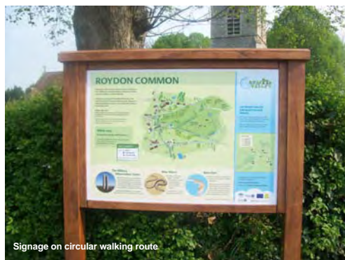
Signage on circular walking route

The Gaywood Valley project sought to unlock the potential of the Gaywood Valley, to the east of King's Lynn in Norfolk, as a natural environmental amenity. The project presented opportunities for social cohesion, environmental education, training and volunteering, the local economy and leisure and recreation. Further benefits were associated with the management of wildlife habitats connected with the Gaywood Valley project and improved flood-risk management.