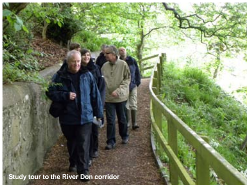
Study tour to the River Don corridor

Develop and promote new methods for assessing and managing open spaces along the River Don corridor, for the benefit of the local economy, environment and communities. The aim was to bring people and organisations together with information, tools and techniques to develop a more collective approach to the planning and management of open spaces along the River Don corridor.