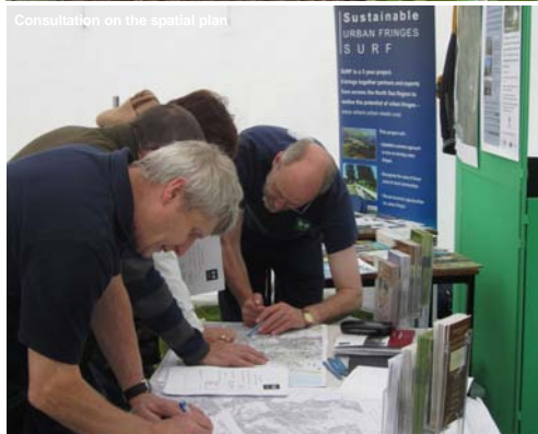
Consultation on the spatial plan