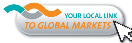
The use of the logo as a button – version 2.