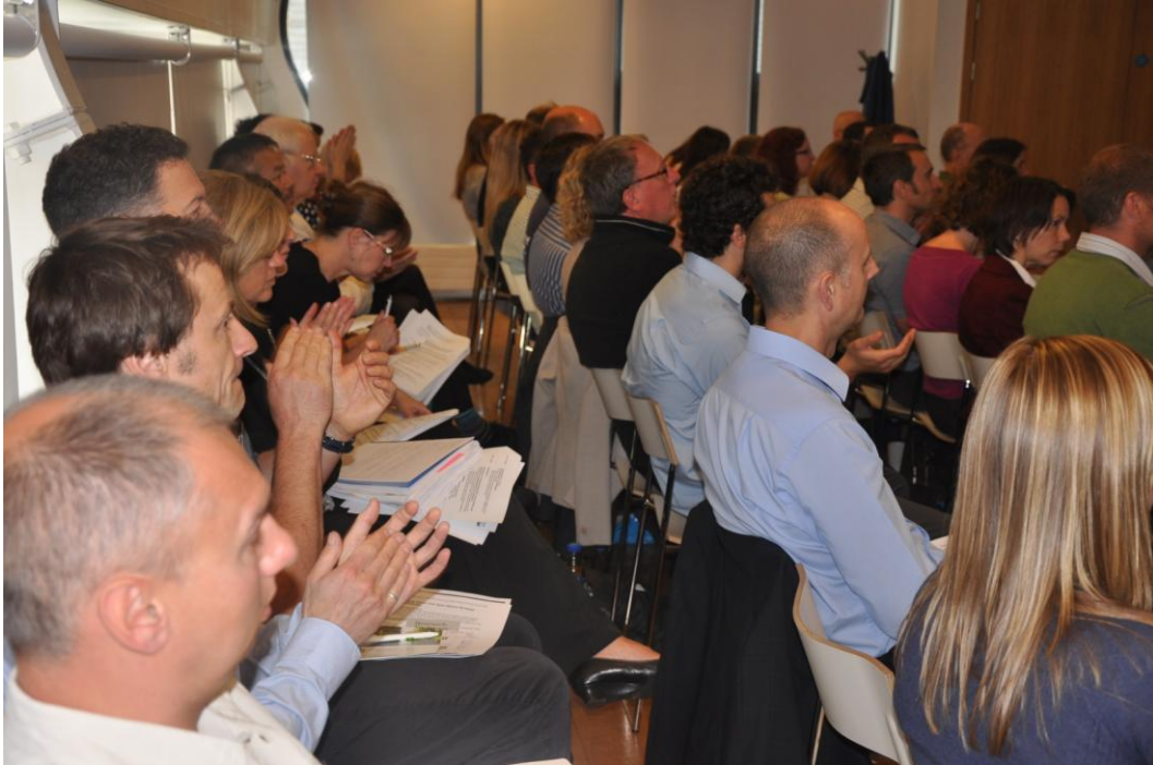
Image 3: Event delegates listening to invited speakers in the morning session.

This event marked the launch of a new chapter for place-keeping , with place-keeping identified by delegates as an effective approach to tackling current issues in green and open space provision and management.