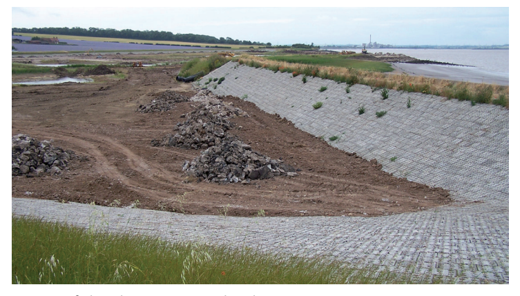
Creation of Chowder Ness Managed Realignment Site