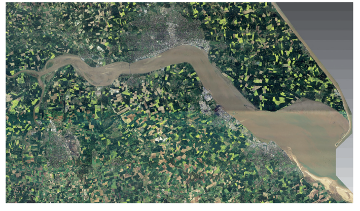
Aerial view of the Humber Estuary in 2009