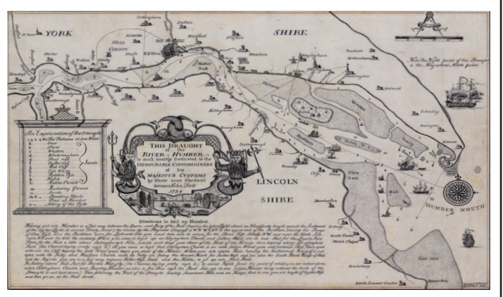
Humber Estuary Admiralty Chart dating from 1734

The main challenge for estuary managers lies in allowing economic activity and development to continue within the estuarine system, such as expansion of the ports, against a background of large scale historical habitat loss, ongoing coastal squeeze and the possibility of more frequent storm events as a result of climate change.