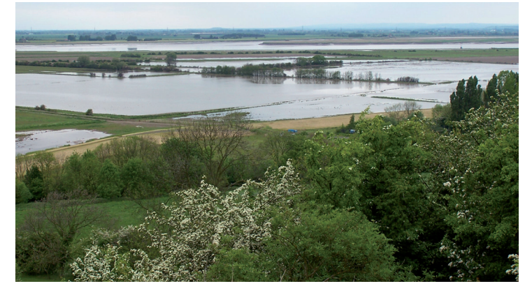
Alkborough Managed Realignment Site