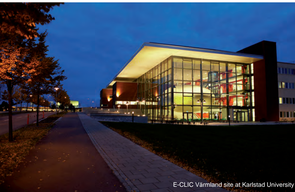
E-CLIC Värmland site at Karlstad University