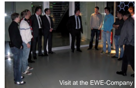
Visit at the EWE-Company

Some case studies have been written as well as some descriptions of prototypes.