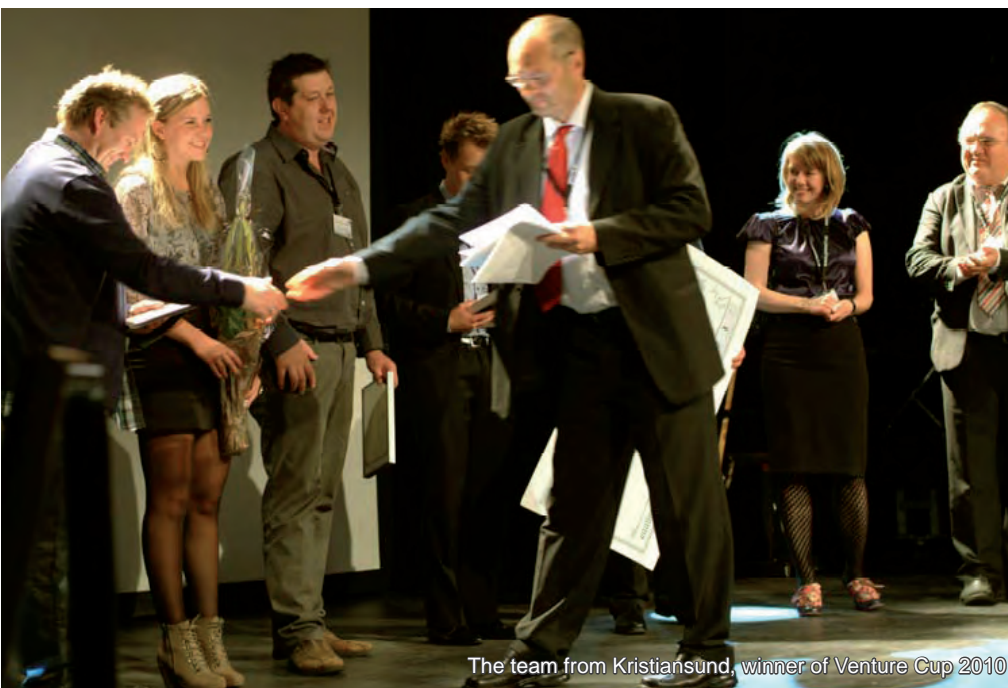
The team from Kristiansund, winner of Venture Cup 2010

Apart from E-CLIC Rogaland, UiS also hosts a centre for student entrepreneurship, which includes a centre for innovation. The latter is working with innovation and entrepreneurial processes. Recently discussions have been held on how to coordinate and possibly merge these activities. One of the issues for such discussion is the recent E-CLIC Baltic application, another one the APMS 2011 conference.