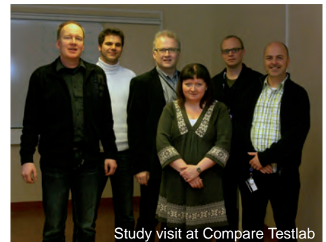
Study visit at Compare Testlab