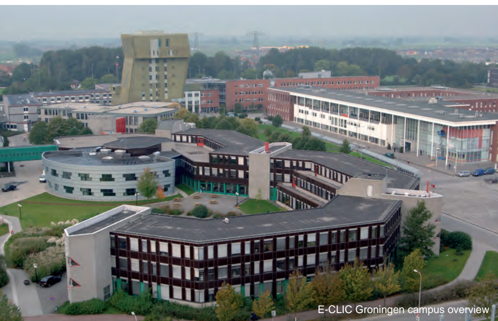
E-CLIC Groningen campus overview