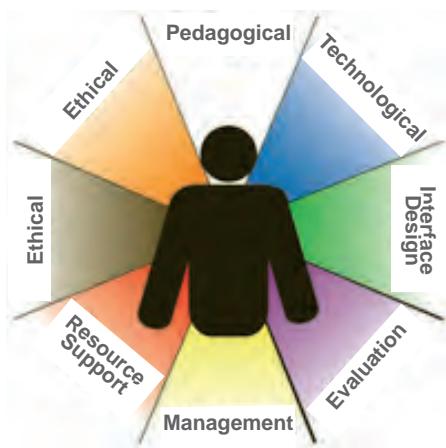
A Framework for E-Learning

The E-CLIC centre in Rogaland continues the work started in 2009. The work in WP3 and WP4 on developing e-learning applications continues. This is both for flexible education of nurses and other applications. The work is based on the dynamic application of Adobe Flash and podcasting. We have had several cases published at Apple iTunes University, and from the campus several courses are directly transmitted to the Internet.