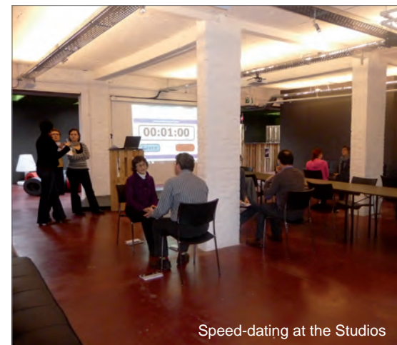
Speed-dating at the Studios