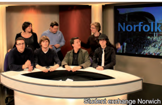
Student exchange Norwich

Student and lecturer exchange has been at the top of the agenda lately. In February 2011, The Studios were pleased to send four lecturers and four students to Epic TV Studios in Norwich, UK for a one week filming and editing experience. Not only did the Howest contingent get a feel for the city of Norwich and its culture, they also got to explore student life at the two local universities. After several days of story-boarding, filming, editing and getting studio-set practice, the students were proud to deliver videos highlighting their observations.