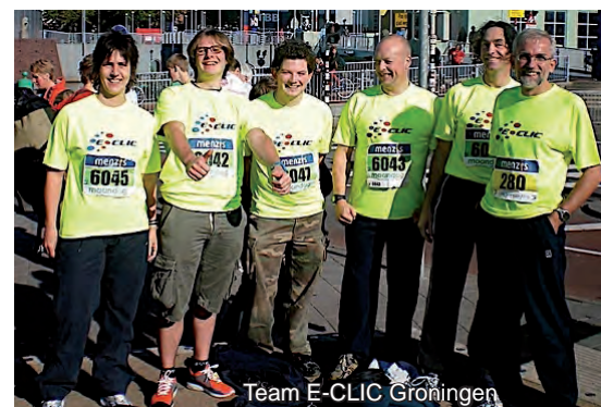
Team E-CLIC Groningen

In autumn 2010 E-CLIC Groningen participated with an E-CLIC-team in a running race to promote their activities. More than 15,000 runners participated and more than 50,000 spectators were present and encouraged the runners. The exposure of E-CLIC was very successful.