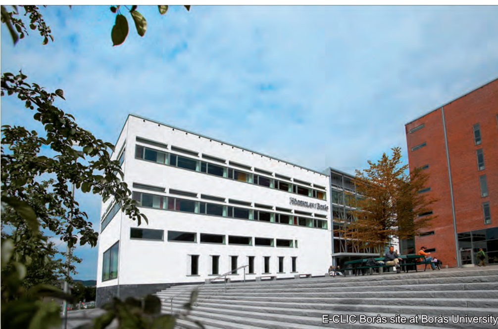
E-CLIC Borås site at Borås University