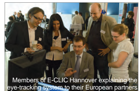
Members of E-CLIC Hannover explaining the eye-tracking system to their European partners

The new usability laboratory for empirical researches via a state-of-the-art eye tracking system is the newest part of interdisciplinary research and education. The system offers the possibility to analyse the utilisation of media content on desktops, smart phones and tablet PCs. Project objectives are the development of new criteria for the design and editorial work. The first project concerns an analysis and optimisation of journalistic texts. A further project in the usability lab focusses on Web 2.0 in the field of medicine.