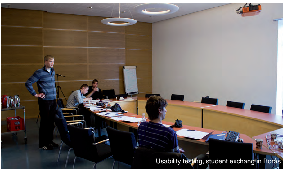
Usability testing, student exchange in Borås