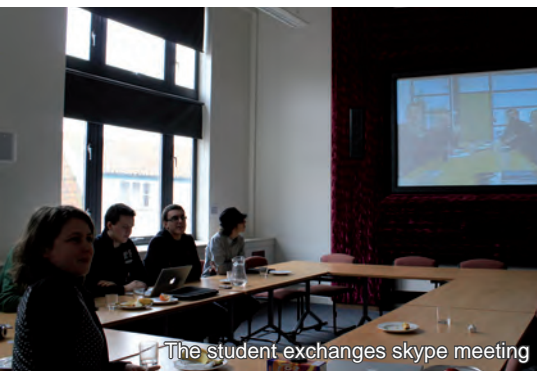
The student exchanges skype meeting

At the same time as the student exchange in Norwich took place, four other Howest lecturers and students were on an exchange in Borås, Sweden. They were testing applications and getting to know the E-CLIC partners there in order to set up further collaborations in the future. The Norwich and Borås groups met each other online via a quick, virtual Skype meeting. Both exchanges will no doubt lead to further, similar transnational, actual and virtual get-togethers.