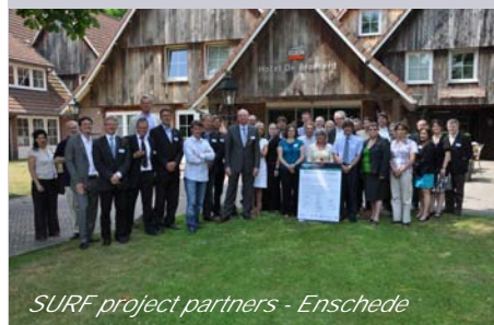
SURF project partners - Enschede

A Partnership Declaration was formally signed by partner politicians and representatives on the first day of the Sustainable Urban Fringes (SURF) Annual Conference on 24 and 25 June 2010.