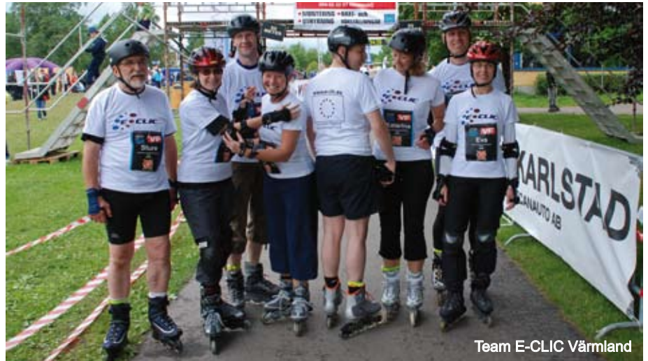
Team E-CLIC Värmland

E-CLIC Värmland decided to promote the E-CLIC project on wheels. The race – Karlstads Stadslopp – took the participants on a tour through Karlstad. A lot of people had gathered to cheer the skaters on, who all made it across the finishing line.