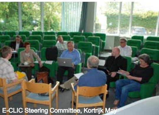
E-CLIC Steering Committee, Kortrijk May

This year's news was the Microsoft Entrepreneurs Forum, where E-CLIC was presented as an accelerator for new media industry in Kortrijk, Belgium. A panel discussion was held concerning the gaming industry, including the changes that can be expected within this sector in the Belgian market.