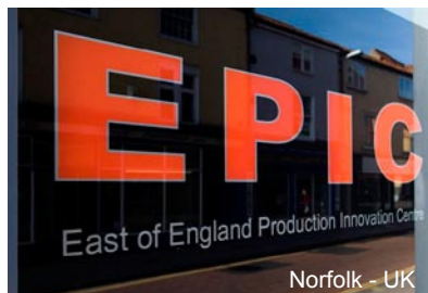
Norfolk - UK