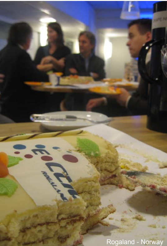
Rogaland - Norway

Development, deployment and provisioning of broadband services and content, Gaming and E-learning.