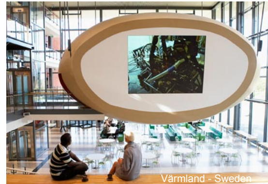
Värmland - Sweden