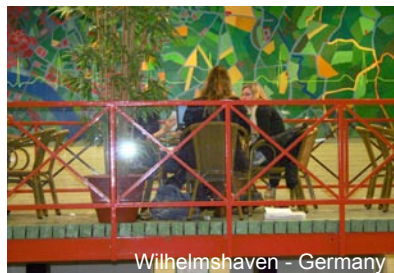
Wilhelmshaven - Germany