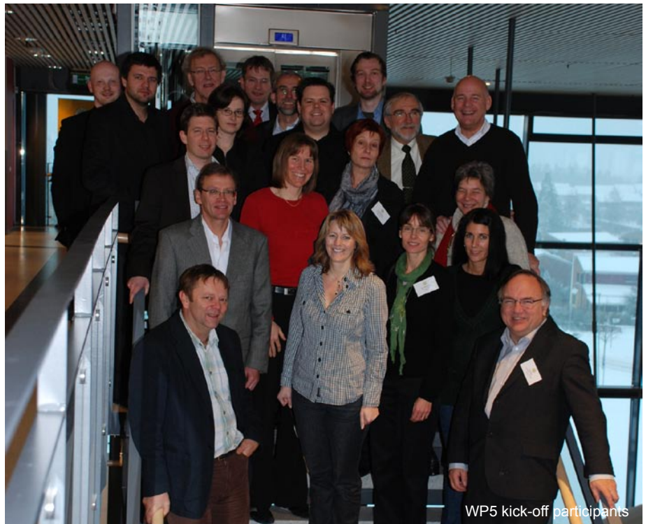
WP5 kick-off participants

In the early morning of 12 December all participants were invited to celebrate a typical Swedish tradition – Lucia – who comes to bring light to the darkness in Sweden.